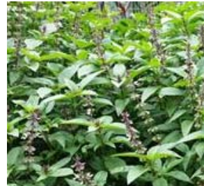
Basil & Fennel herbs