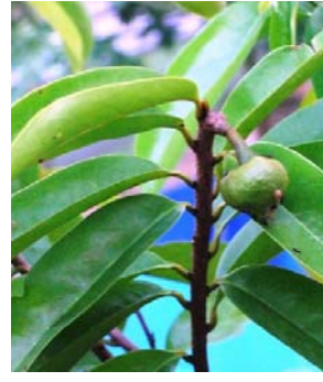
Sour sop planted by CEO